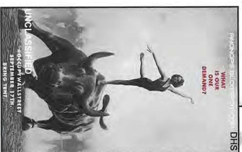
(U) Poster for "US Day of Rage" protest.

(U//FOUO) The ideologies set forth by Adbusters seem to align at a basic level with the stated intent of Anonymous' newly adopted Hacktivist agenda. The protests are likely to occur due to the high level of media attention garnered by the partnership between Adbusters and Anonymous. Though the protests will likely be peaceful in nature, like any protest, malicious individuals may use the large crowds as cover to conduct illegal activity such as vandalism. Judging based on past behaviors by the group, Anonymous' participation in these protests may include malicious cyber activity, likely in the form of distributed denial of service attacks targeting the computers of financial institutions and government agencies.